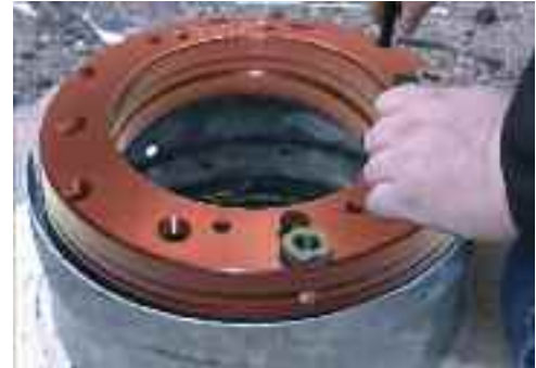
The drill fixture ring is shown here installed on an extension and is elevated for illustration purposes only.

Step 1) Install the 15/32" bushing in the fixture. Use 15/32" drill bit and drill through spacer rings, flange and/or the top flange.