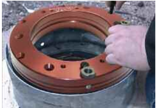
The drill fixture ring is shown here installed on an extension and is elevated for illustration purposes only.

Install the 1/4" bushing in the fixture. Use 1/4" drill bit and drill through the bolt. Remove the drill fixture ring. If the bolt hole is not clear, use the screw extractor and remove the broken stud.