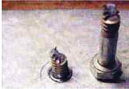
1/4" Hex Cap Screw in A312, Type 316 Plate

After bolt failure, remaining bolt segment was removed by hand, with no insert thread deformation