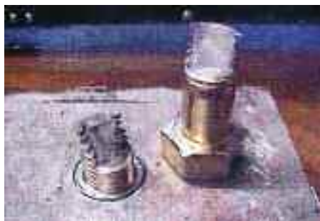
3/4" Hex Cap Screw in A36

After bolt failure, remaining bolt segment was removed by hand, with no insert thread deformation