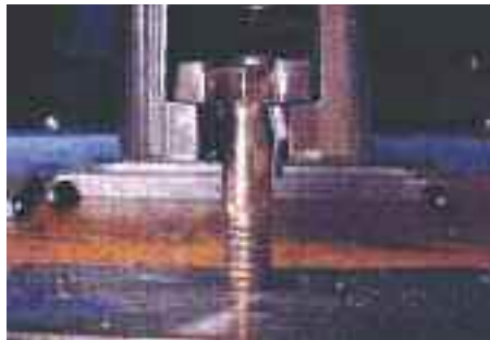
1/2" Hex Cap Screw in A312, Type 304 Plate

After bolt failure, remaining bolt segment was removed by hand, with no insert thread deformation