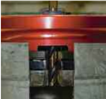
Cut away for illustration purposes only.

Remove light fitting and install drill fixture ring using proper fasteners. (867B or 868B)