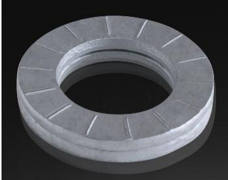
Preassembled Glued Pairs

Specifically designed to solve the problem of fastener failure. Preassembled in glued pairs for ease of installation.